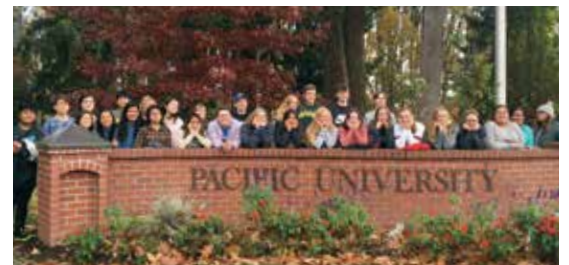
Student from 9-12th grades pose on a recent visit to Pacific University in Forest Grove, OR.

Cubby Preschool was an integral part of my education at Newport High School. This class was different from all of the rest as I was able to apply the knowledge I learned in the classroom to the real environment of a preschool. Cubby Preschool allowed me the unique opportunity to lead classes, despite just being a high school student. Being in the position of leading classes not only helped me understand how to work better with children, it also allowed me to learn and refine my skills to fit the needs of the children. Additionally, I was successfully able to practice my leadership and teamwork skills in this class, as I had to rely on my peers to accomplish the task of teaching lessons daily. I strongly believe that being a part of Cubby Preschool affected my life positively and was the basis of inspiration for my career goal of becoming a pediatrician. Cubby Preschool is truly a one of a kind program, as many of my peers at Pacific University never had the same program at their respective high schools, and because of this, I feel so fortunate to have been a part of the Cubby Preschool program.