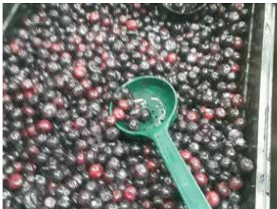
Local berries from Stahlbush Farms in Corvallis.

Remember all breakfast, snacks, and lunch are provided to all students every day at no charge in every school!