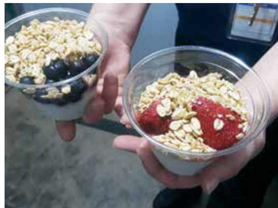
Breakfast parfaits as part of no charge breakfast for all.